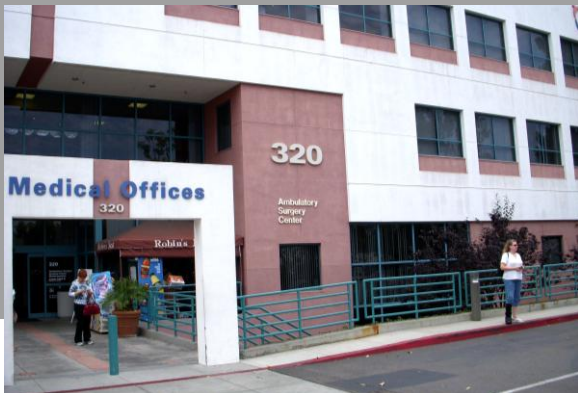
EAR Audiology is conveniently located on the campus of Scripps Memorial Hospital Encinitas.

Video otoscopy Pure-tone and speech audiometry Word recognition testing Speech-in-noise testing Tinnitus assessment Tympanometry Acoustic reflex measurement Eustachian tube function testing Otoacoustic emission evaluation Real-ear measurement